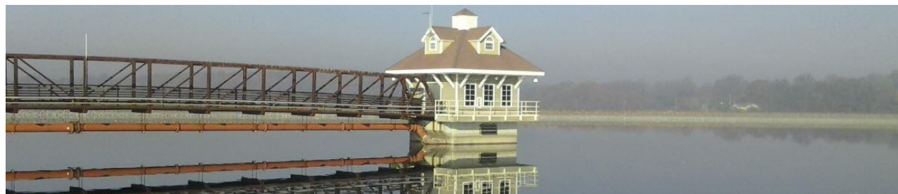
Newark Reservoir

The City of Newark is a full-service utility provider, overseeing water, wastewater, and electricity to residents, businesses, industry, and the University of Delaware. The City also maintains and manages a stormwater-sewer system that channels and carries stormwater runoff from City streets to surface water or stormwater management facilities.